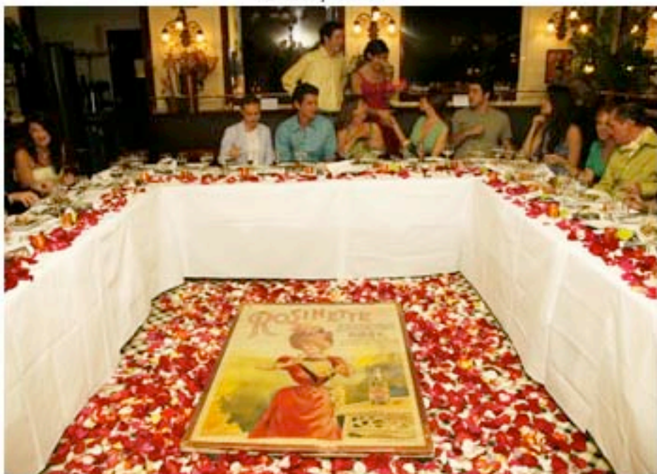
The dinner table